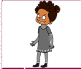
the head / a headache