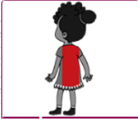
the back / a backache