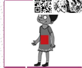
the stomach/ stomachache