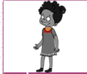
the throat / the sore throat