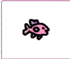
a small pink fish