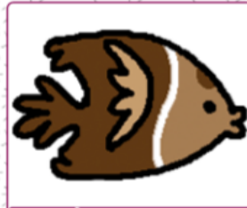
a big brown fish