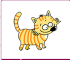
an orange cat