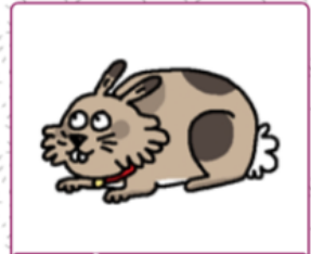
a big grey rabbit