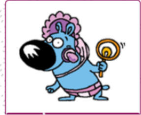
a blue puppy