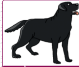
a big black dog