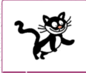
a black and white kitten